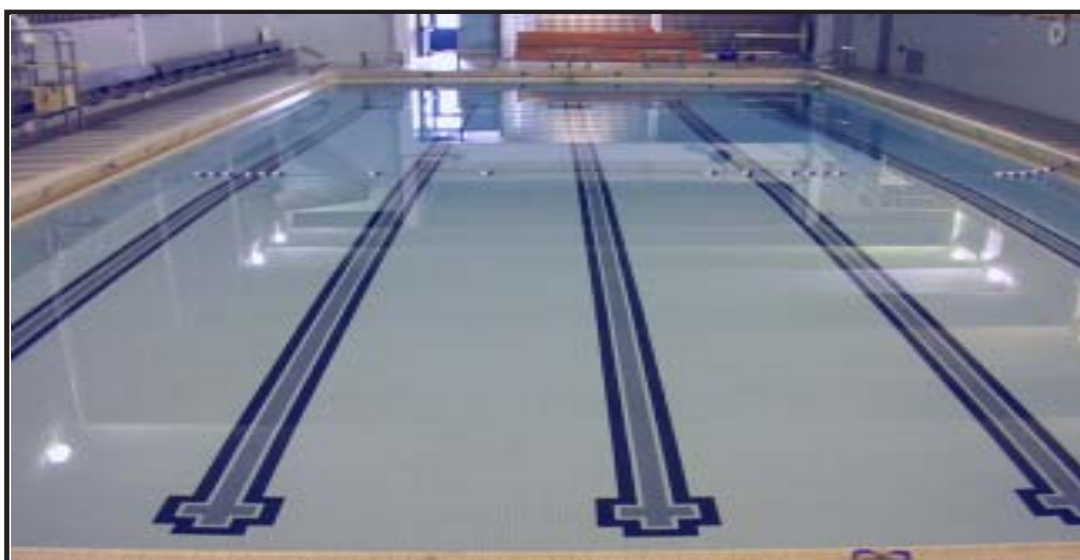
CENTRES OF EXCELLENCE: The BOA will use regional pools for UK training

I say the tragedy is that people have not realised that we, as a sport, would be much stronger if we acted together.